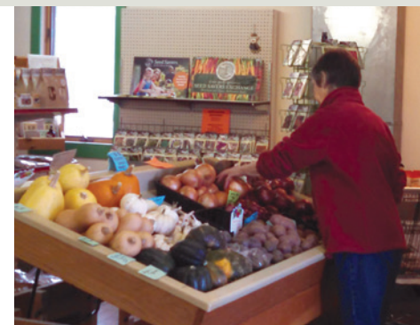
Community members can enjoy a variety of local foods and products at Ideal Green Market.